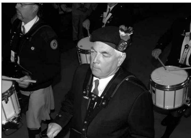
New York Local 3’s Sword of Light Pipe and Drum Band made an emotional entrance during the opening ceremonies.