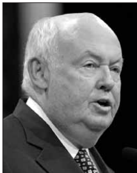
John J. Sweeney AFL-CIO President

Citing the strong spirit of national unity immediately after Sept. 11, Sweeney said "our new spirit of national unity was crushed by the people who are running" our country. "While publicly praising the work of first responders and our unions, our national leaders returned to their anti-working-family agenda, slashing taxes for the wealthy, passing out no-bid labor agreements, trying to privatize Social Security and destroy the collective bargaining