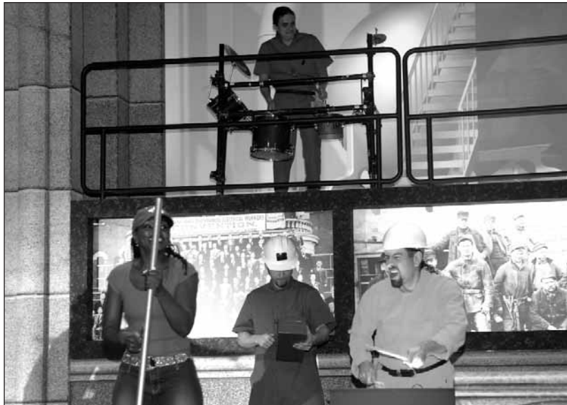
A rhythm and dance troupe entertained the delegates.